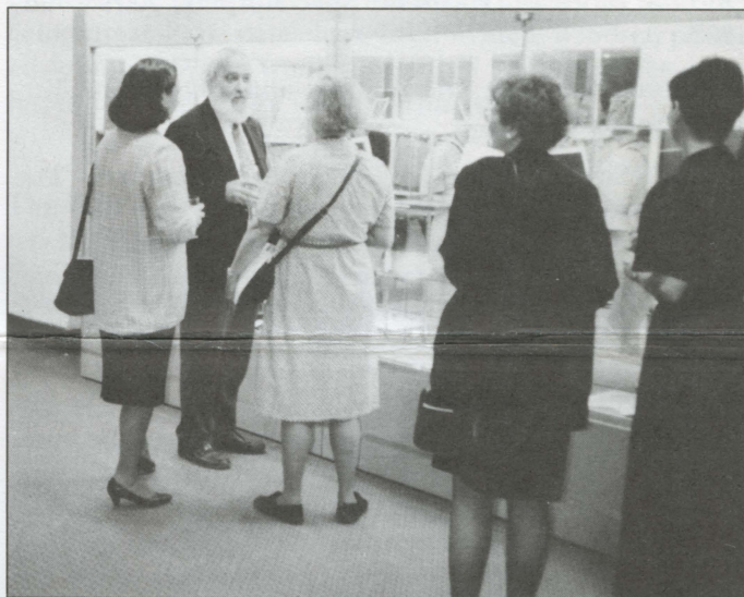
Members and guests viewing exhibition of books for sale at APHA Benefit Auction and reception held at Sotheby's.

Three special books were awarded as door prizes to members who had been unsuccessful bidders in both the live and silent auctions. But all APHA members will benefit from the evening as well, even those who missed the fun because they did not attend: the proceeds have been used to defray APHA's operating expenses.